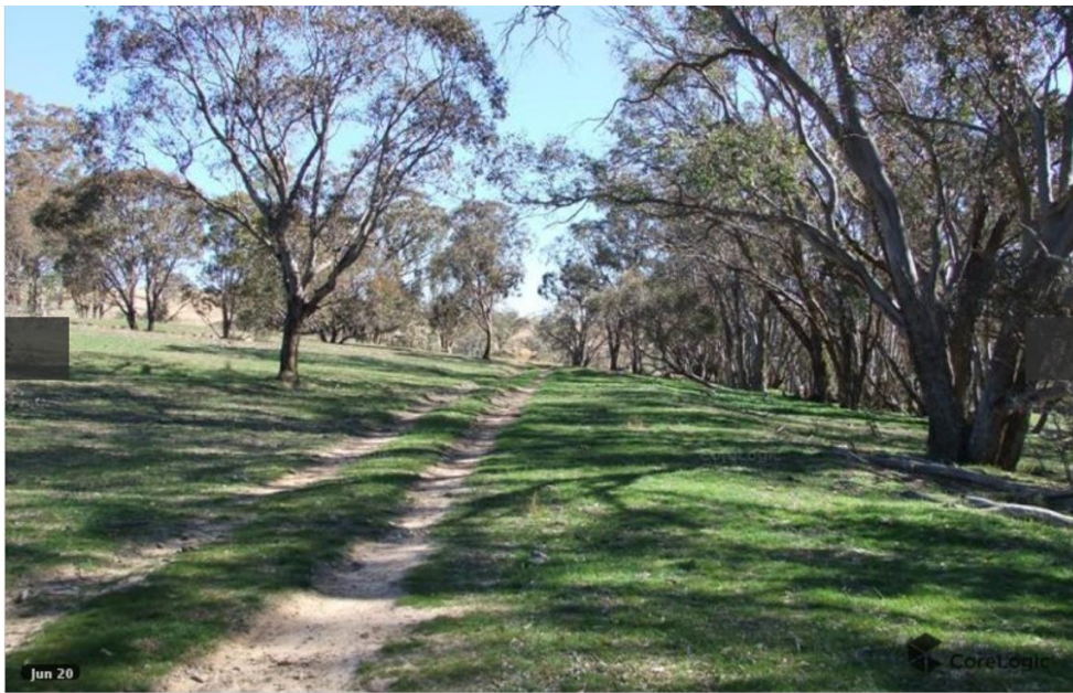
Photo of 1572 Carcoar Road, Carcoar, NSW 2791

Property C - Nominated in the report as a Rural property without a view of the wind farm.