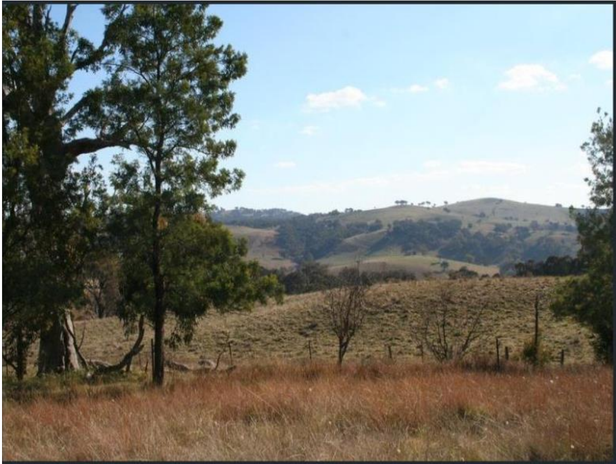
Property E - Nominated in the report as a Rural property without a view of the wind farm