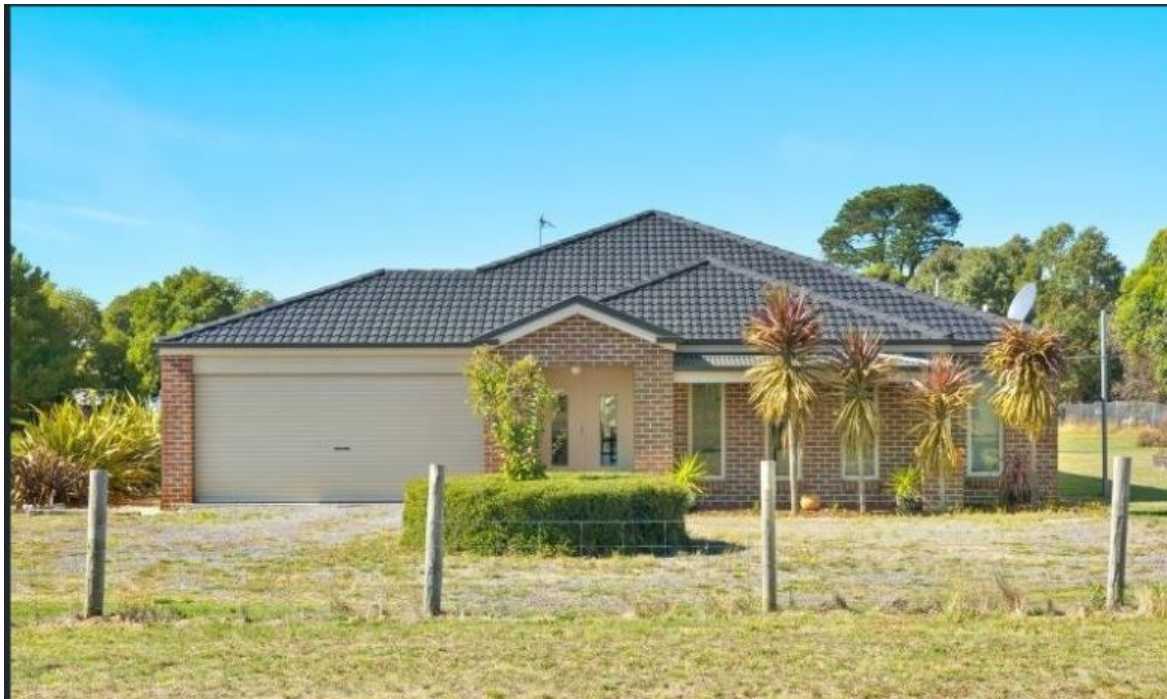
Photo of the new home at 85 Kimberly Drive, Waubra, Victoria