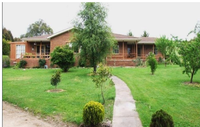
Photo of property 7 - 7 Troy Road, Waubra, Victoria

The value of the property has been significantly impacted by the presence of the wind farm.