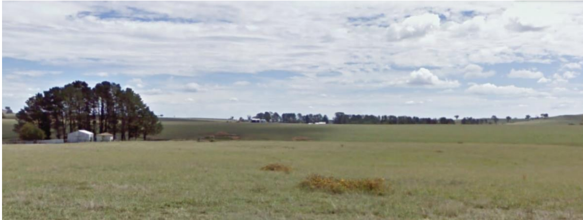
Photo of Property 1 – 468 Neville Road Blayney, Cleared grazing with buildings and silos in the distance

Property 2 A Rural property without a view of the wind farm